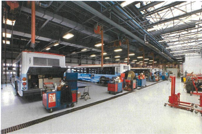
Proper clearances and organization improves safety