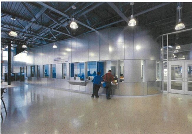
Dispatch as a central hub with access to all activities