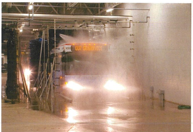
Automated vehicle wash as part of daily return procedure