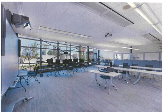
Well equipped training facility