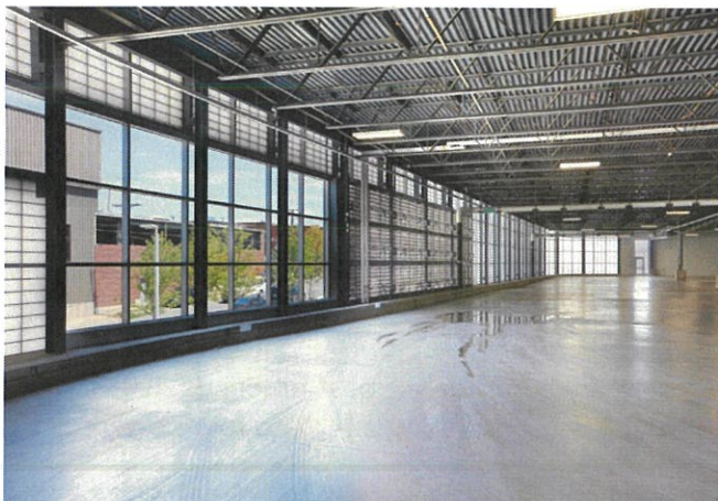
Provide ample natural light and ventilation