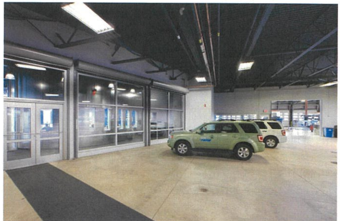
Separate people and vehicles